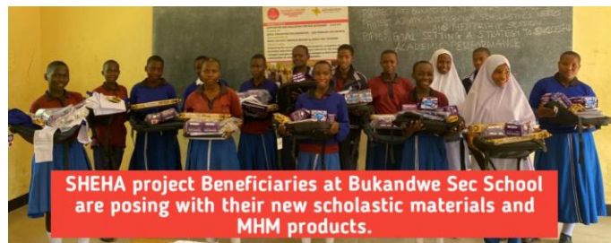
SHEHA project Beneficiaries at Bukandwe Sec School are posing with their new scholastic materials and MHM products.